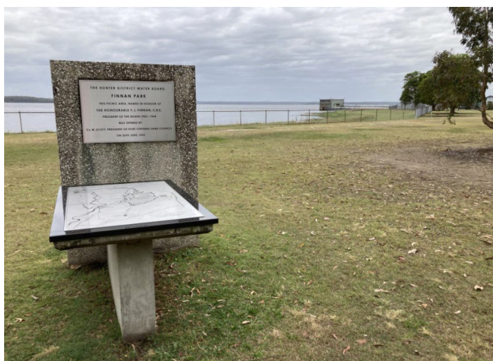
Image 1: View of the Park in relation to the Ferodale 1A Water Pump Station in background