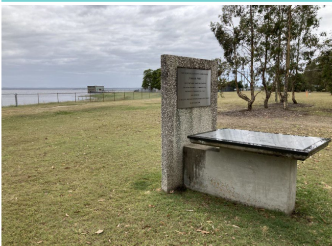
View of replacement plaques on an original plinth within the Park