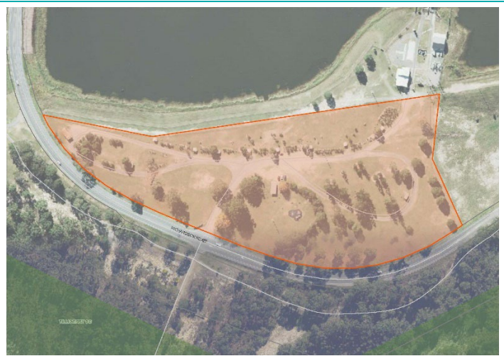
Asset location and curtilage (red boundary) (refer to Figure 1 for additional detail)