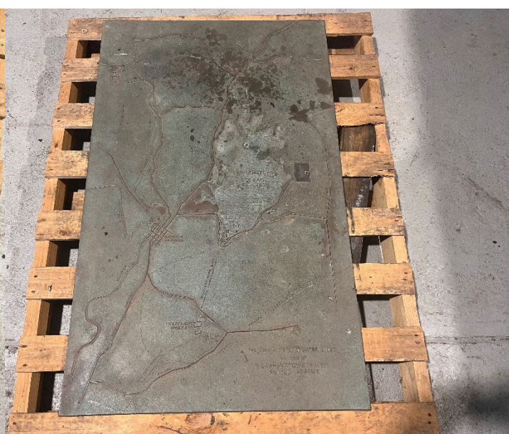
Image 3: Original plaques in storage at the nearby 'Catchment Rangers' building