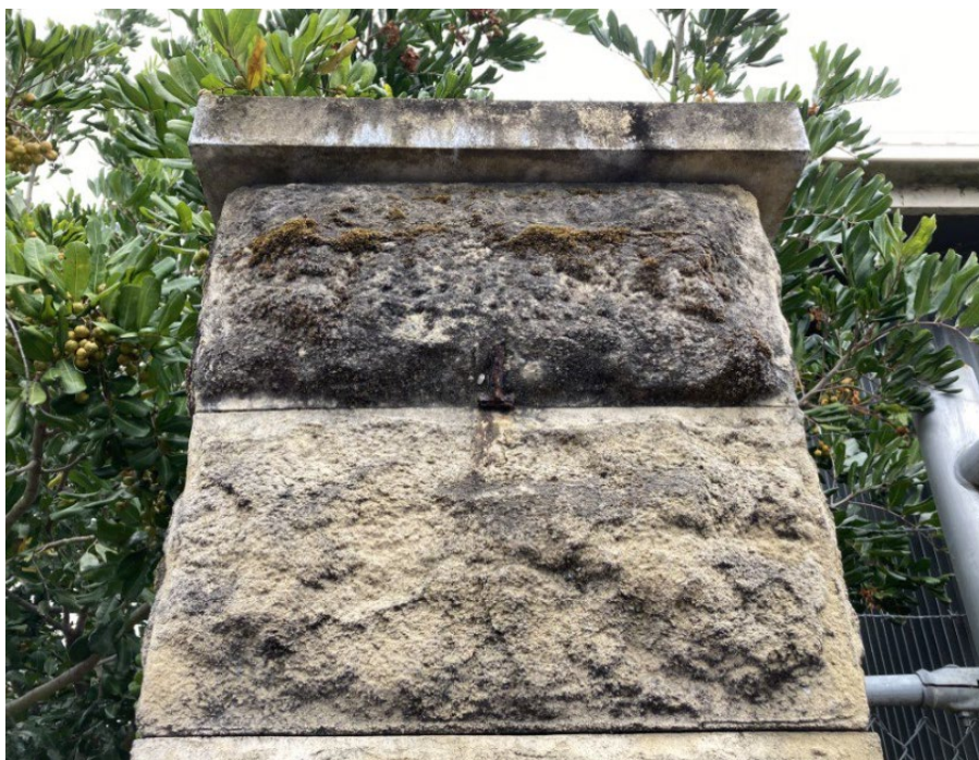
Image 3: Detail view of the western pillar showing stone and capping