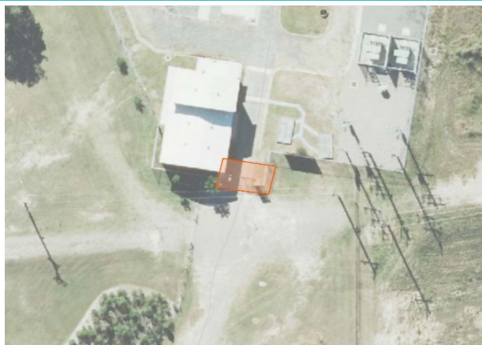
Asset location and curtilage (refer to Figure 1 for additional detail)