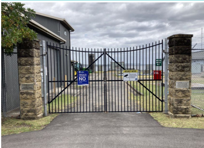
View of the gates within the Park