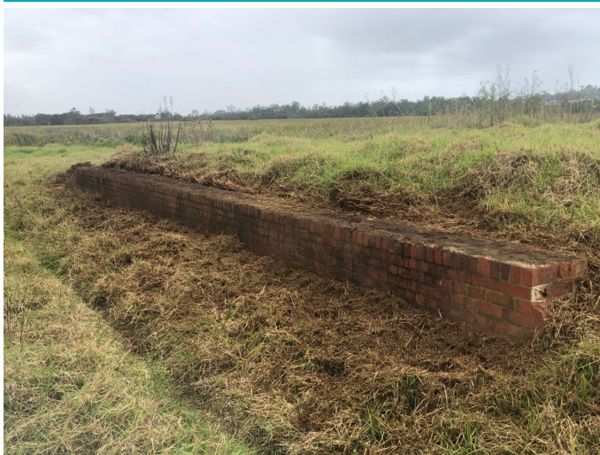
View of the former railway platform