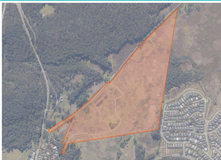
Asset location and curtilage (red boundary) (refer to Figure 1 for additional detail)