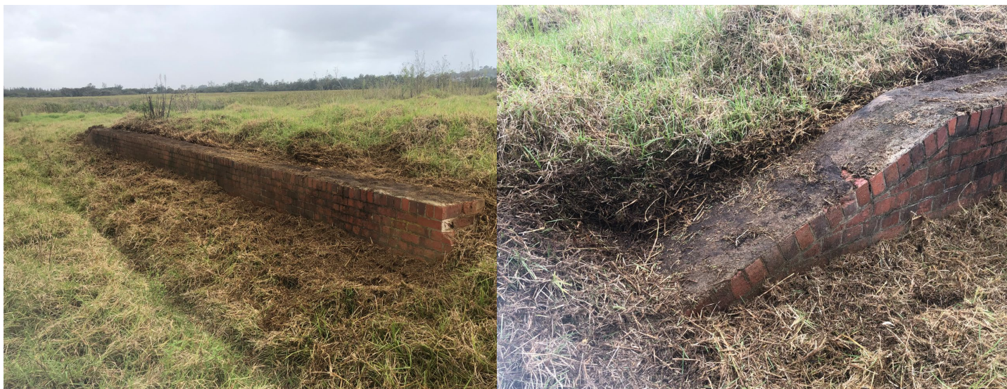
Image 1: General view of site showing in situ railway platform and siding alignment