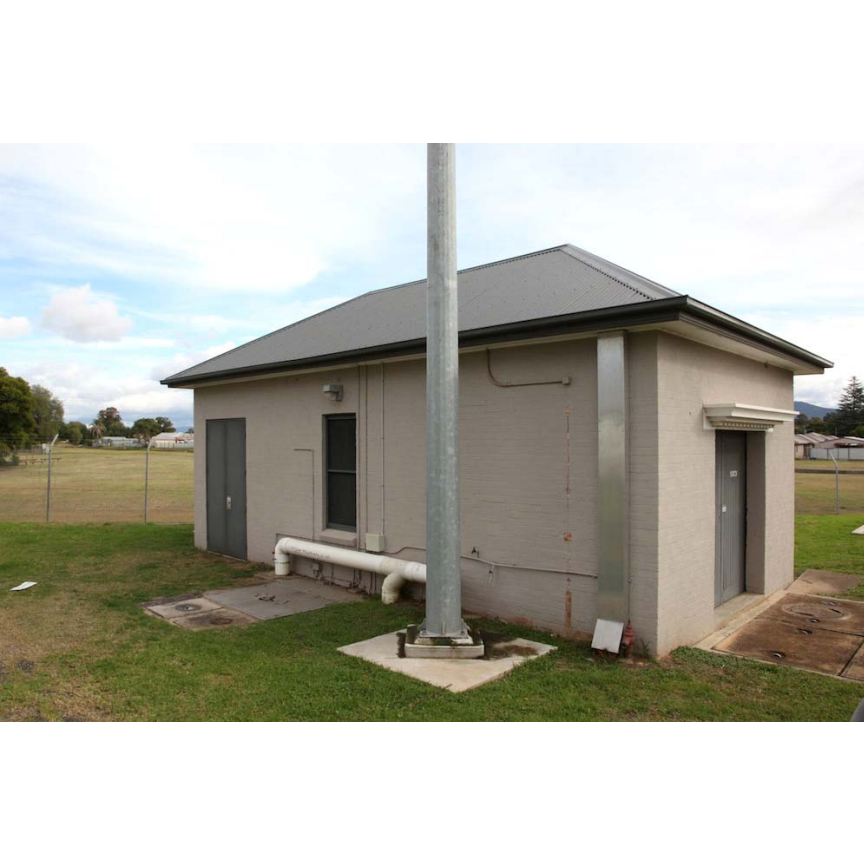
Cessnock 1 Waste Water Pumping Station