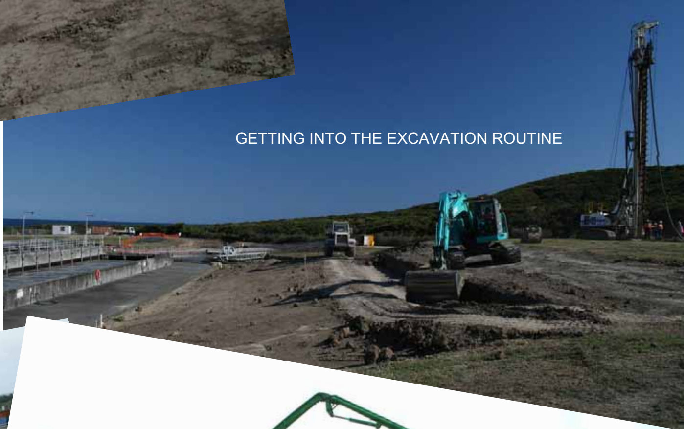
GETTING INTO THE EXCAVATION ROUTINE

Civil engineering works for construction of a third Aeration Tank at Burwood Beach WWTW is progressing quickly. Initial site clearing started on 12 October 2009 and with only a few days of rain in between, concrete pouring for the blinding layer started on the 18 Nov 2009.